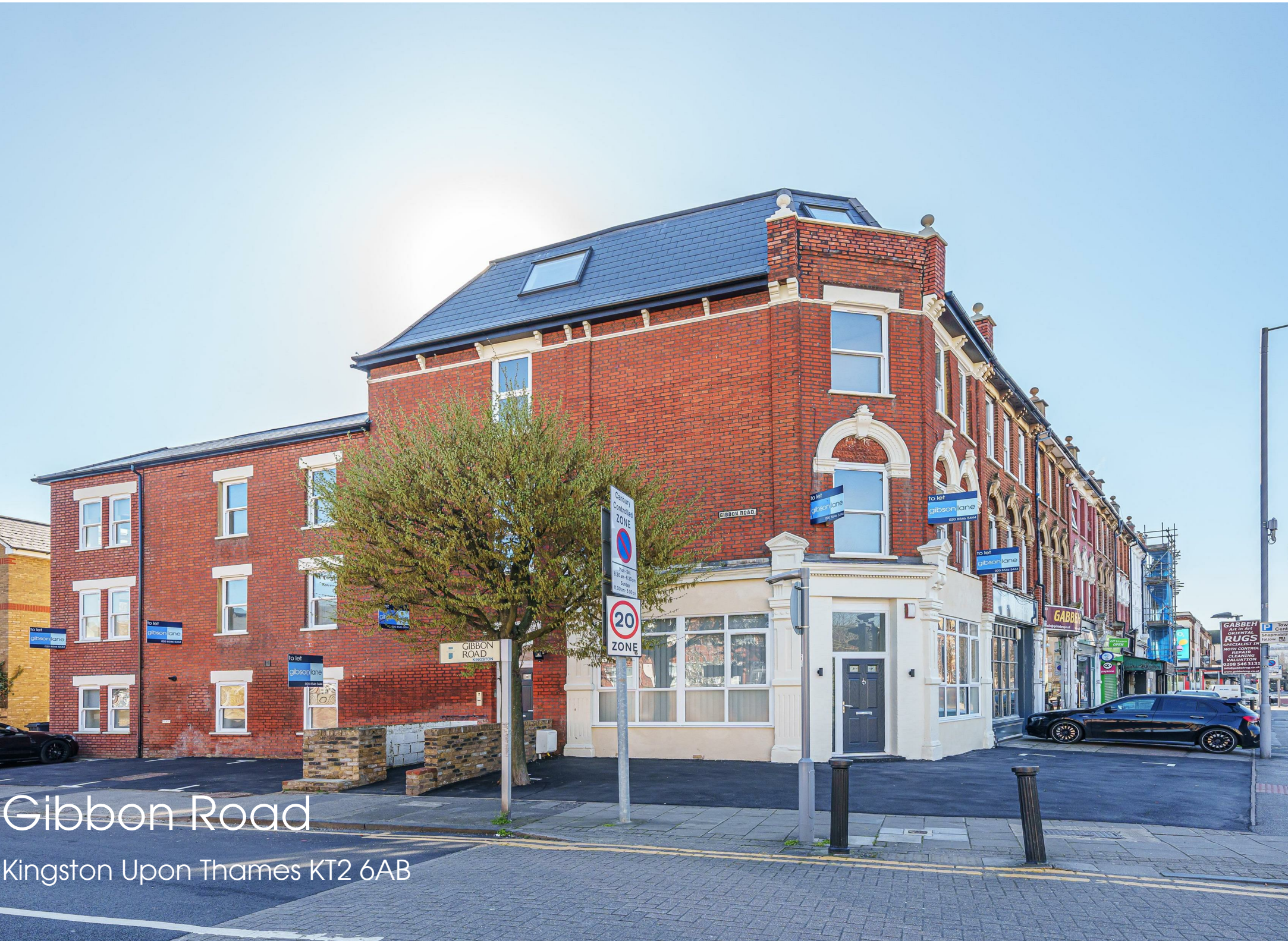
Gibbon Road Kingston Upon Thames KT2 6AB